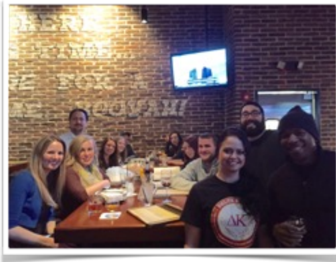
Having a great time at the Brick House Tavern & Tap