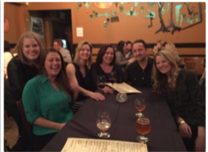
Working on Self-Care at Panera Bread